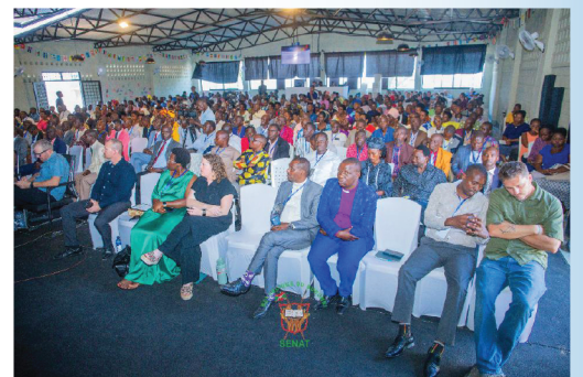
Banwe mu bari bitavye urwo ruganda