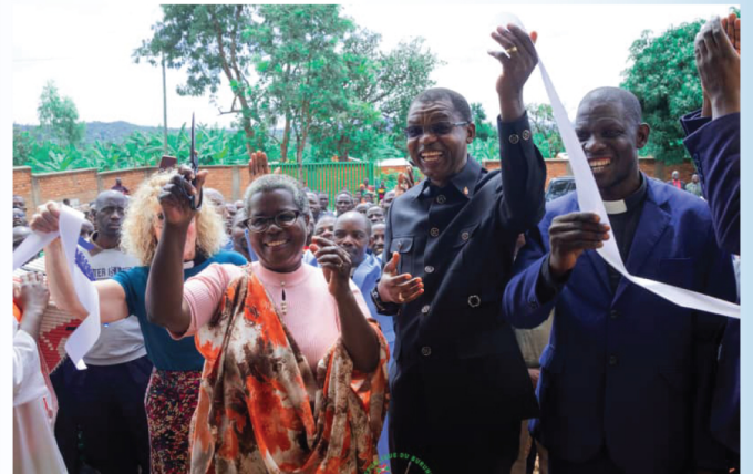
Ikimenyetso c’ukwugurura iryo vuriro

Nyeniteka arongoye Inama Nkenguzamateka, yarakiriye ibikoresho vy’iryo vuriro, vyashikirijwe n’ubushikiranganji bujejwe amagara y’abantu, yongera arashikiriza amazi meza abenegihugu baba hafi y’iryo vuriro.