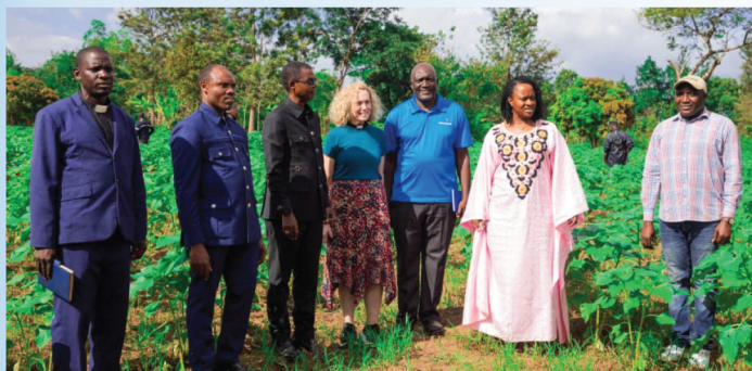
Urugendo mu murima w’ibihoke

Mw’ijambo ryiwe, Nyeniteka Sinzohagera, yasavye ubwo bushikiranganji kubandanya bushigikira iryo vuriro mu buryo butandukanye, nko mu kurironsa umuganga yanonosoye ivyo kwakira abavyeyi bibaruka, hamwe n’uwujewe isuku n’isukura.