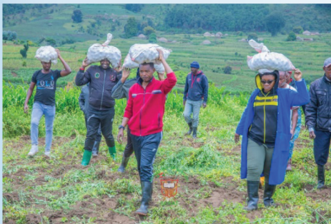
Umuryango w'Umukuru w'Inama Nkenguzamateka mu bikorwa vyo kwimbura ibiraya

Yasavye ubushikiranganji bujejwe uburimyi n'ubujewe ubudandaji kuja hamwe bugateza imbere igisata c'uburimyi mu gushiraho amahinguriro y'umwimbu, bikazotera intege umurimyi.