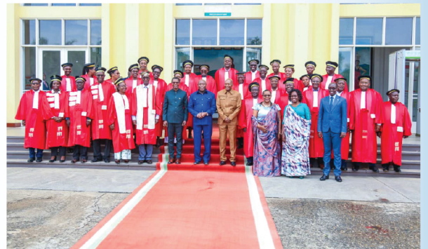
Bamwe mu bari bitavye ivyo birori

Mu birori vyari bihagarariwe n’Umukuru w’igihugu, Nyenicubahiro Evariste NDAYISHIMIYE, vyatunganijwe ku wa 24 Ntwarante, umwaka w’2025, mu ngoro y’amakoraniro, mu Kigobe, mu gisagara ca Bujumbura, Umukuru wa Sentare ijejwe gucungera amatungo ya Reta mushasha, hamwe na babiri bo mu murwi w’igihugu ujejwe kumenya ukuri n’ukunywanisha abarundi, bararahiye, imbere y’Inama Nshingamateka na Nkenguzamateka zikoranye.