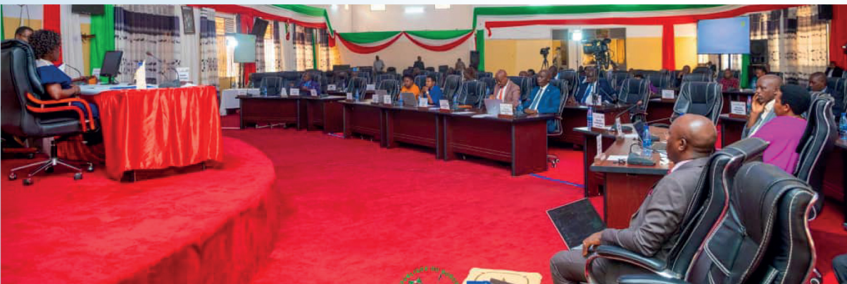
Abakenguzamateka mu nama ya bose

Mu nsiguro yatanze, uyo mushikiranganji, yamenyesheje ko iyo nteguro y'ibwirizwa ije kugira Uburundi bushire umukono ku mpinyanyuro zakozwe ku ngingo ya 50 agace ka mbere, n'iya 56 z'amasezerano agenga ivyo gutwara abantu n'ibintu mu kirere kugira ngo ibice vyose vy'umubumbe w'isi vyumve ko biserukiwe.