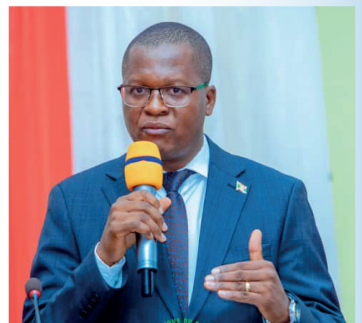
Umushikiranjanji ejejwe ikigega ca Reta

Yarashikirije n'ivyerekeye ubuhinga bwo gutoza amakori bikenewe ko butosorwa bugatera imbere