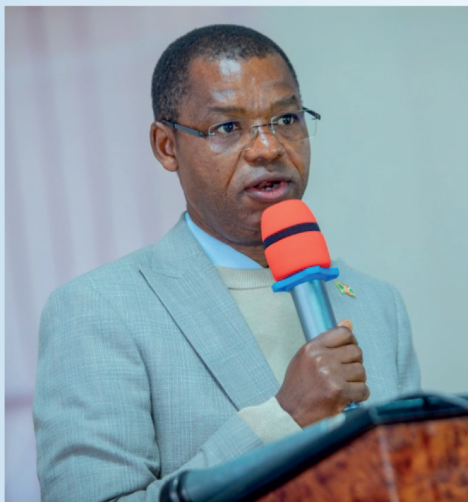
Nyeniteka Umukuru w'Inama Nkenguzamateka

Abarongoye imigambwe basabwa kuzoshira imbere abizigirwa mu matora yimirije