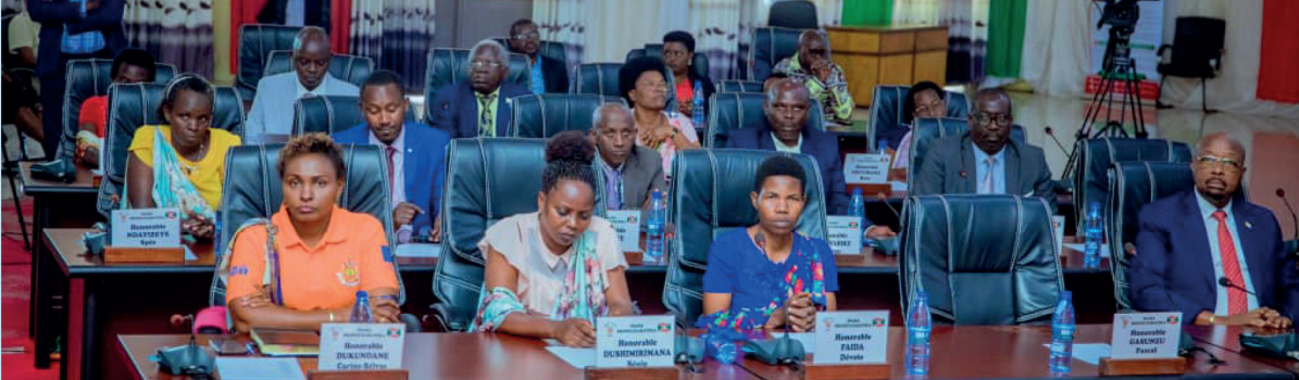
Bamwe mu bakenguzamateka bari bitavye ivyo birori

Nyeniteka arongoye urwo rwego, yabandanije ashikiriza abari aho ko