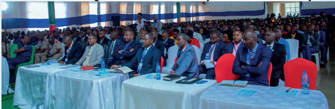
Bamwe mu bari bitavye izo nyigisho

Yasavye abari bitavye izo nyigisho kuja gushira mu ngiro ivyo bari bahejeje kwiga.