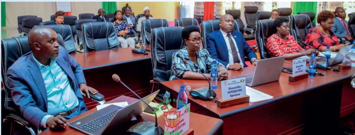
Ramwe mu bakenguzamateka hari bitavuye inama v'ubuho muni

Yamenyesheje ko umwenehugu wese akwije imyaka 18 kandi atarindi shirahamwe ry'abaturanyi arimwo, abwirizwa kuba afise ikarata CAM yo kwivurizako. Ati: "Twahindura kandi urugero rw'amakori akaduzwa nko ku mazu n'amatungo agurishwa. Tuzogarukana kandi amafaranga ari kuri konte igenewe kurwanya ikiza ca COVID-19."