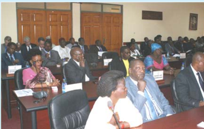
Abakenguzamateka bumviriza ijamba ry'ibikorwa vy'isasa rya Gitugutu

Yaciye atanga uburorero ku vyerekeye imvugo zitabereye z'abanyeporitike bamwe bamwe, ingeso y'ubunabwoba,