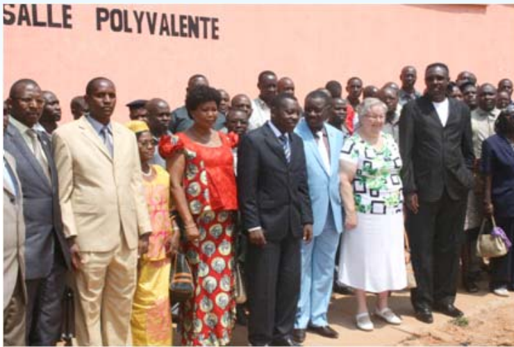
Umukuru w'Inama Nkenguzamateka n'ivyegera vyawe, icyegera c'uwuserukira ishirahamwe AWEPA n'abandi banyacubahiro bari bitavye ivyo bikorwa

Iryo huriro ryari ryateguwe n'Inama Nkenguzamateka ifadikanije n'ishirahamwe ry'abashingamateka n'abakenguzamateka ba Buraya bashigikiye Afrika, AWEPA.