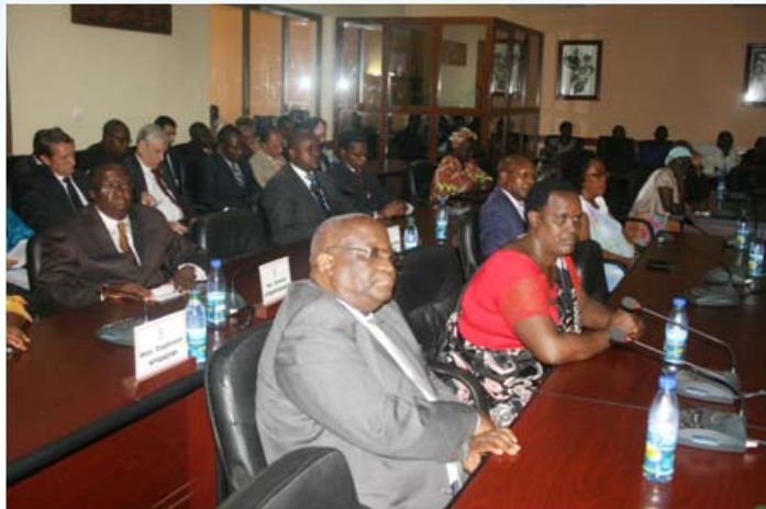
Abakenguzamateka n'abatumire b'iteka bumviriza ijambo ry'umukuru w'Inama Nkenguzamateka

Mu bikorwa vyaranze isasa rya Ruheshi 2014, Nyakwubahwa Ntisezerana yamenyesheje ko hizwe integuro z'amabwirizwa icumi, Inama Nkenguzamateka yagenzuye ibikorwa vya Reta mu gutegura ibibazo bitandukanye vyishuwe n'abashikiranganji indwi, abakenguzamateka baremeje abaja guserukira Uburundi,