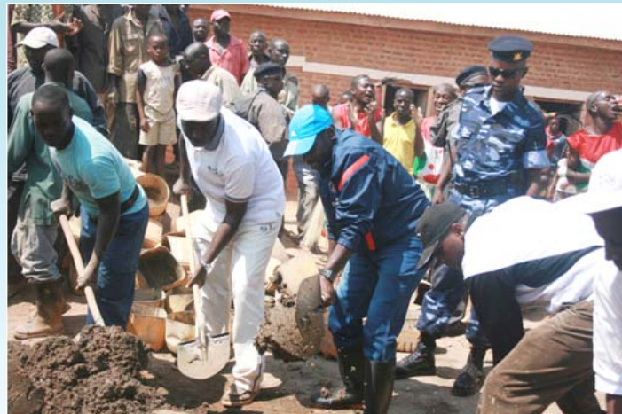
Umukuru w'Inama Nkenguzamateka mu bikorwa rusangi vyo kwubaka ishure nshingiro ku mutumba Nyabitabo wo muri komine Mabanda

Kuri icyo mitumba itatu yagendeye, umukuru w'Inama Nkenguzamateka yahimirije abenegihugu kubandanya biteza imbere, kubana mu mahoro, kuvyara ku rugero,