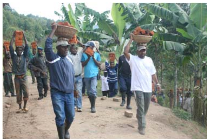
Nyakwubahwa Ntisezerana yifadikaniye n'abenegihugu mu bikorwa vyo guseha amabuye yo kwubaka ibiro vya zone Ruce muri komine

Umukuru w'Inama Nkenguzamateka yasavye abenegihugu kugwanya ubunebwe no kwihatira ku bikorwa vy'iterambere ry'igihugu na cane cane iry'imiryango yabo.