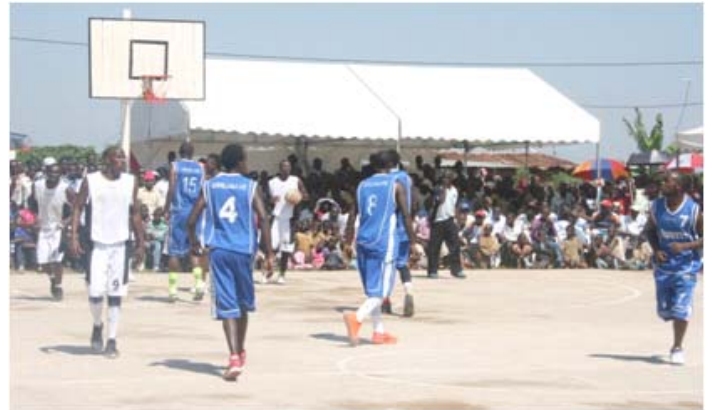
Ihiganwa rya Basketball hagati y'imirwi y'Ununani na New Star

Uburundi mu mahiganwa mpuzamakungu aca abasaba guca batangura imyimenyerezo yo kuyitegurira.