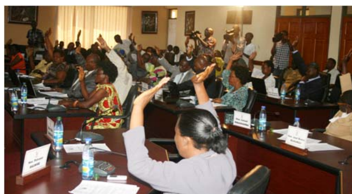
Abakenguzamateka bemeza integuro y'itegeko

Ayo masezerano atuma abenegihugu b'ivyo bihugu uko ari bibiri bafise izo mpapuro bashobora kwinjira mbere bakarengana baciye muri ivyo bihugu. Ivyo bihugu kandi birashobora kubuza kwinjira, kuba ku butaka bw'ivyo bihugu no kwirukanwa bisabwe n'ivyo bihugu vyateyeko umukono kuri aya masezerano. Inama Nkenguzamateka ikaba yemeje ayo masezerano kw'igenekerezo rya 01 ndamukiza 2014.