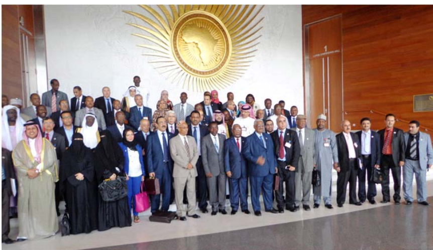
Bamwe mu bitavye inama ya ASSECAA yabereye muri Etiyopiya