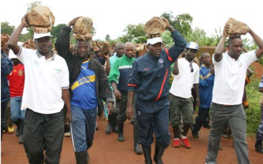
Nyakwubahwa Gabriel Ntisezerana (uwa 2 uva i buryo) yifadikaniye n’abenegihugu bo ku musozi Buhindo mu bikorwa vyo kwegeranya amabuye yo kwubaka ishure nshingiro

Umukuru w’Inama Nkenguzamateka, Nyakwubahwa Gabriel Ntisezerana, yahamagariye abenegihugu gutsimbataza amahoro n’umutekano kugira ngo bashikire iterambere rirama. Iyo yabishikirije kw’igenekerezo rya 12 ndamukiza 2014, mu nyuma y’ibikorwa vyo kwubaka ishure