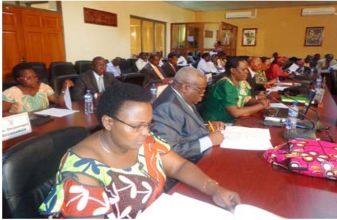
Abakenguzamateka mu ngoro y'amakoraniro

Abakenguzamateka barongeye baremeza Jenerari Joseph Nkurunziza, kw'igenekerezo rya 25 ruhuhuma 2014, ngo aje guserukira Uburundi mu gihugu ca Somaliya.