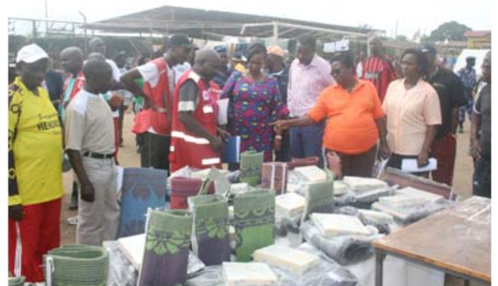
Ivyegera vy'umukuru w'Inama Nkenguzamateka (hagati) batanga imfashanyo mu Kinama

Inama Nkenguzamateka yaraterereye amafaranga atari make.