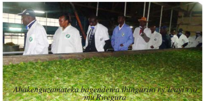
Abakenguzamateka bagendereye ihinguriro ry'icayi rya mu Rwegura

Kw'igenekerezo rya 26 baragenda amashirahamwe arima ibiraya ku mutumba Tondero wo muri komine Kabarore. Kuri uwo muni nyene barishikiye ku rugomero rw'umuyagankuba hamwe no kw'ihinguriro ry'icayi vyo mu Rwegura.